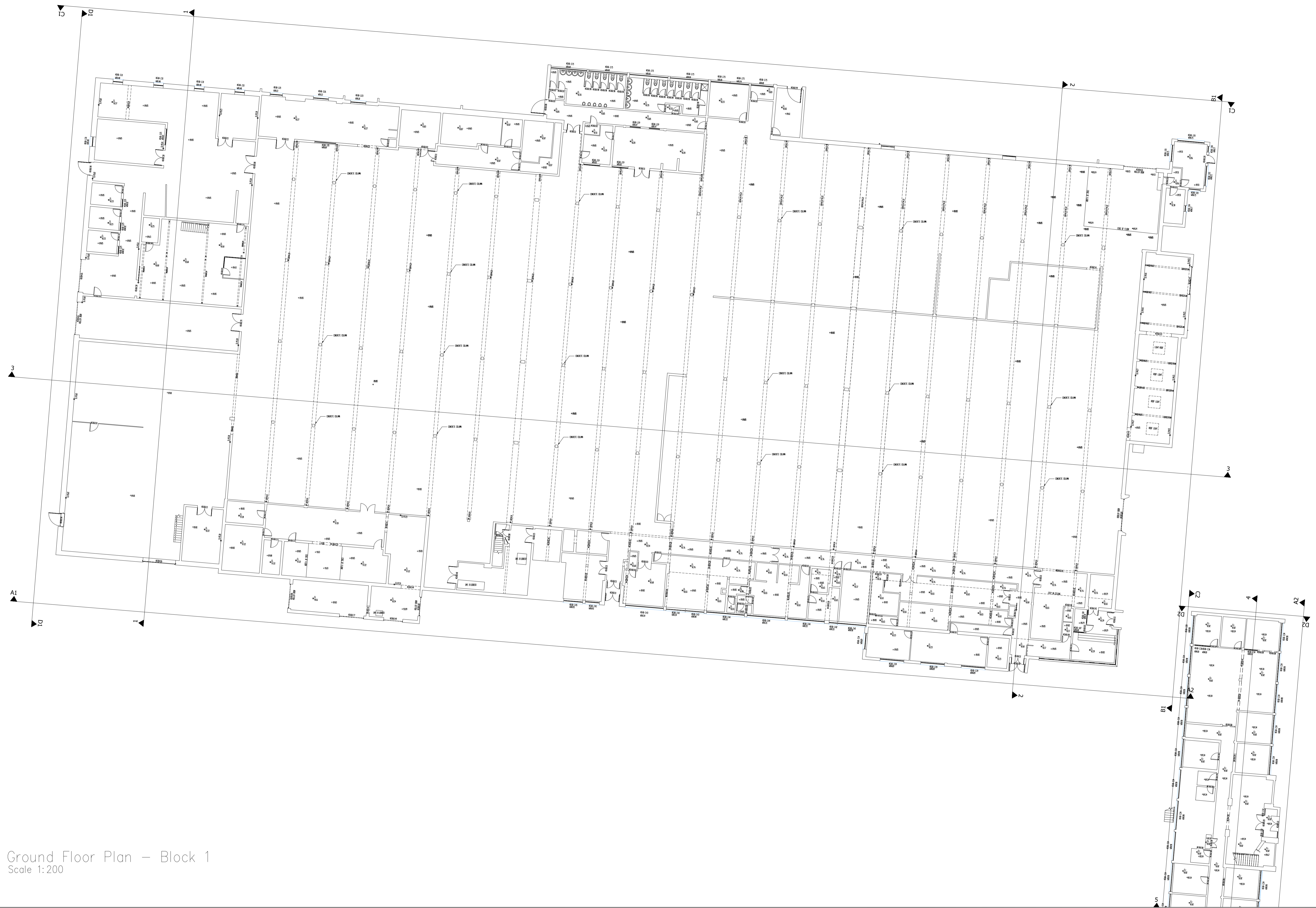
Ground Floor Plan – Block 1 Scale 1:200